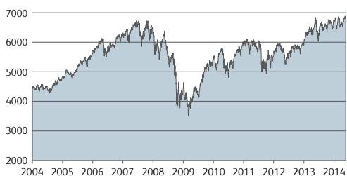
FTSE 100 Index